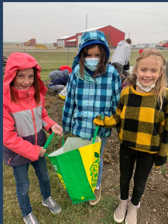
HARVESTING OUR COMMUNITY GARDEN