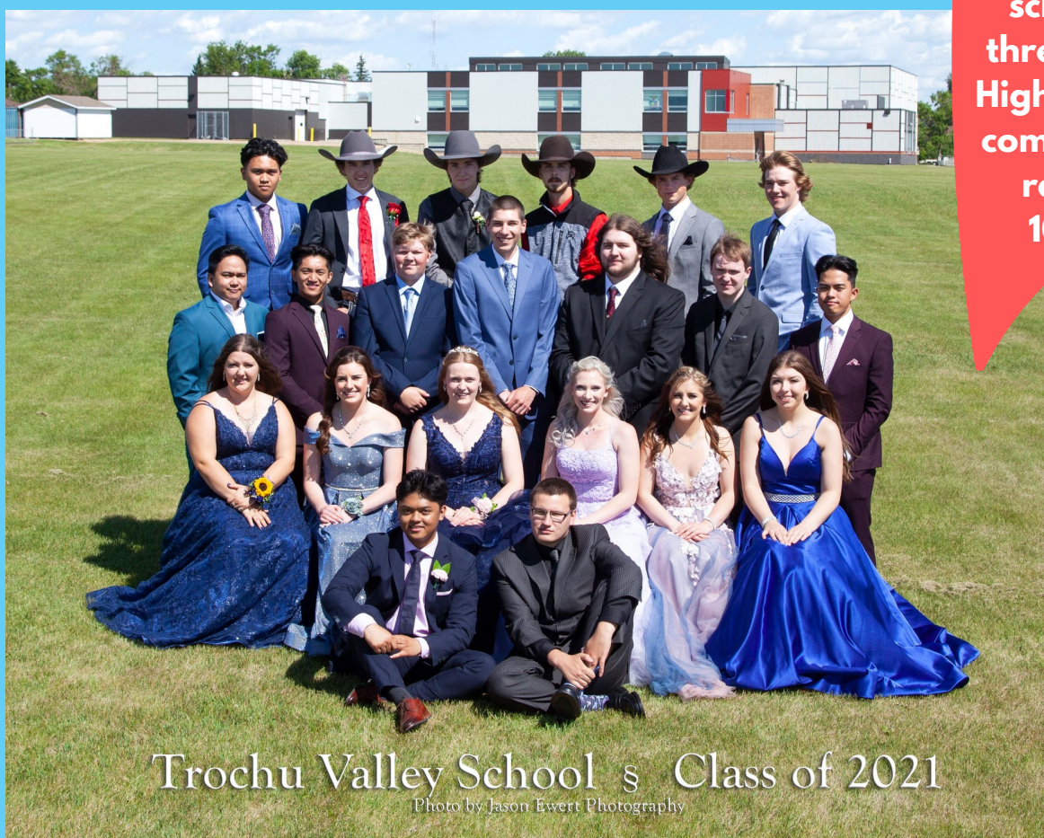
Trochu Valley School's Class of 2021